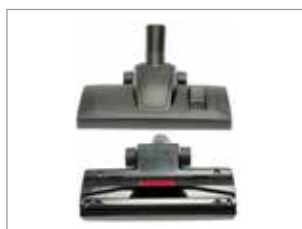
NEW POWERFUL NOZZLE FOR HIGH CLEANING EFFICACY