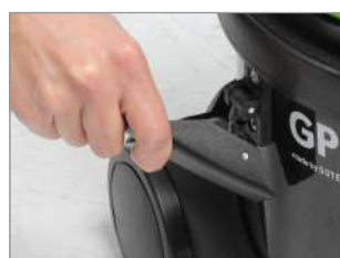
EXTREMELY FLEXIBLE HOOKS