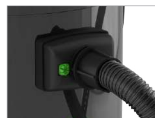
FLEXIBLE HOSE IS LOCKED SECURELY AND RELIABLY